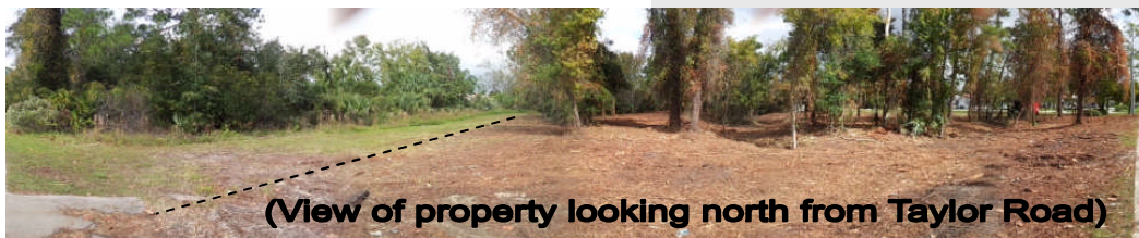
(View of property looking north from Taylor Road)