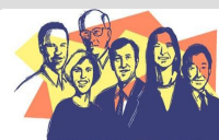
FROM THE DEACONS

What's on the plate for the Deacons Team this Fall? The Deacons are mandated to do several major functions. These functions are important to the Church as we move forward. It is the responsibility of the Deacons to conduct the annual stewardship campaign. This is scheduled to take place before the end of November. We also provide input to the Operations Team for the 2019 budget that pertains to the Deacons responsibilities.